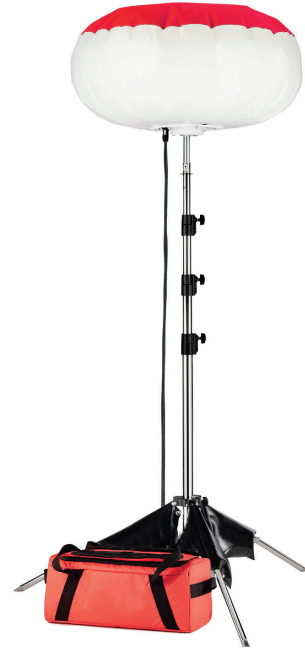
Stand & sand bags not included