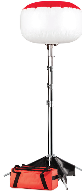
Stand & sand bags not included