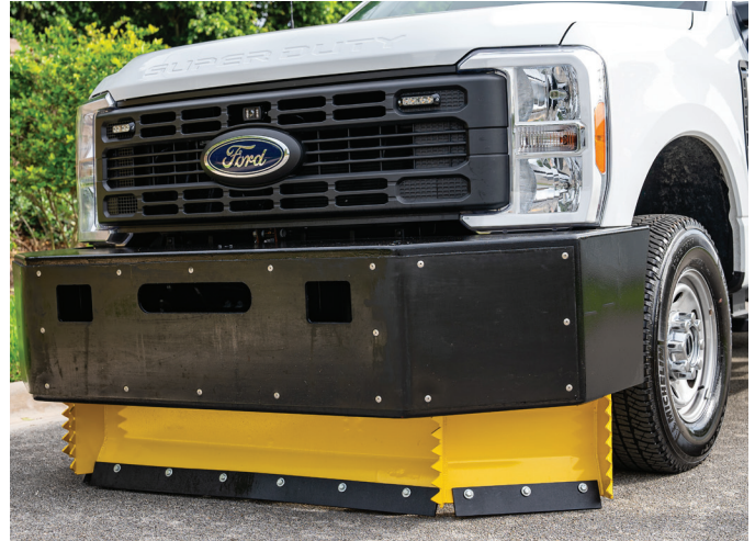
Replaces standard bumpers on three-quarter ton or higher vehicles.