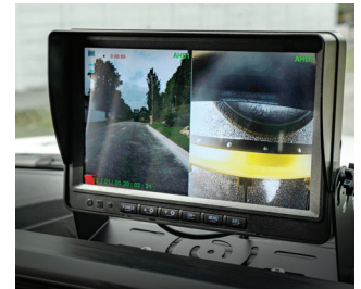
In-truck operation with dual camera system