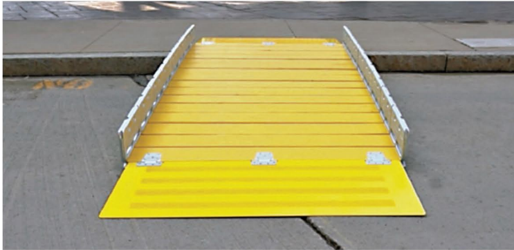
BoardWalk Ramp installed perpendicular to curb.