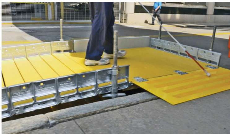
BoardWalk Ramp shown parallel to curb, with optional Platform on right.