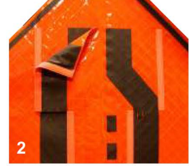
Permanent "Page Over" Overlay (eliminates the risk of lost overlays)