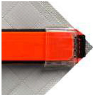
Plastic Buckle Pocket

Allows sign to be mounted to the vertical masts on full size strands.