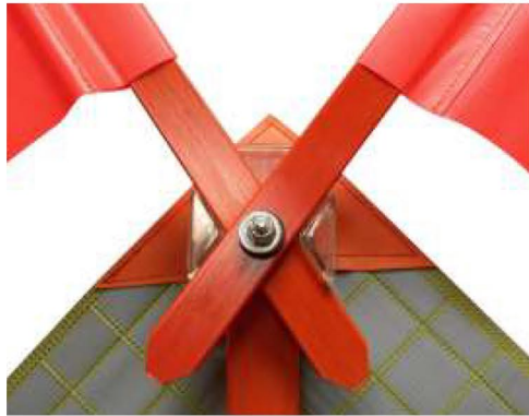
FFS-12 FOLDING FLAG SYSTEM

This permanently attached folding flag system insures that flags will always be handy and ready to deploy. Rotate flags from their storage position to the display position for use, reverse to store sign. Flags are 18" x 18" blaze orange vinyl coated nylon on 1" wide fiberglass staffs. FFS-12 has 2 flags, FFS-13 has 3 flags.