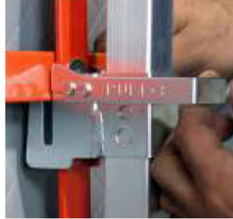
Roll-Up Bracket (RUB3315)

Allows sign to be affixed to various size square and round masts.