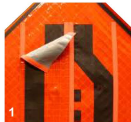
Removable Overlay (least expensive)