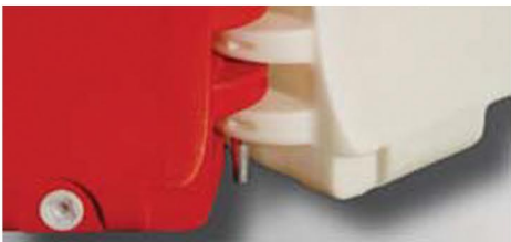
Water-Wall can pivot 30-degrees and be locked together with steel connection pins