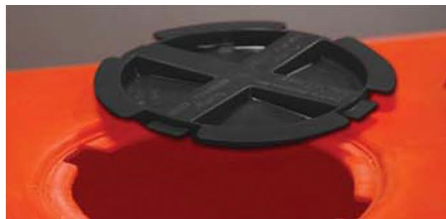
Large 8" fill hole speeds filling process, includes twist-lock plastic cap