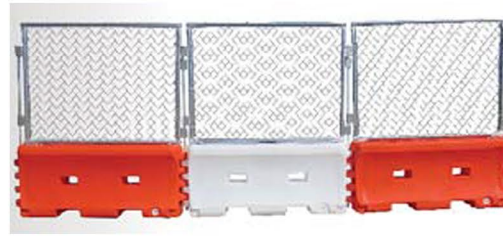
Water-Wall Fence can be easily attached to Water-Wall for additional job-site security.