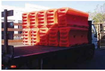
Water-Wall stacks for storage and transportation