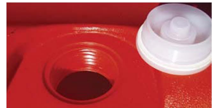
New tamper resistant, offset drain plug with coarse buttress thread