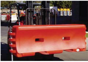
Water-Wall can be easily lifted and placed using a forklift or pallet jack