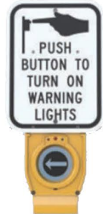
XAV2-LED PUSH BUTTON