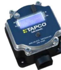
BLINKERBEAM® WIRELESS RADIO