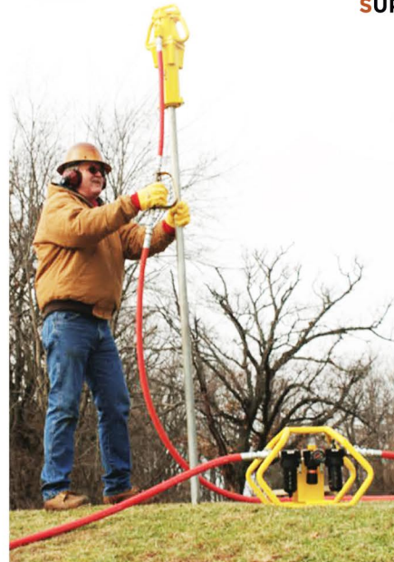
PD-55 shown with FRL and Carrier

Note: Specifications are approximate and subject to change. Some parts shown may be for illustration purposes only.