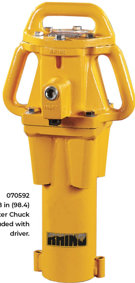
070592 3 7/8 in (98.4) Master Chuck included with driver.