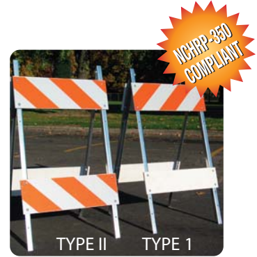
TYPE II TYPE I