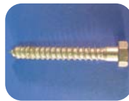
THDW-600 3/8" x 3" Stainless Steel Lag Bolt #16501900