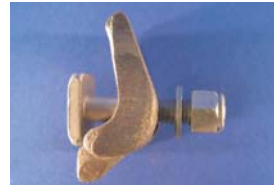
POST CLIP ASSEMBLY

Used to mount Interstate signs with extruded keyways to I Beam post flanges.