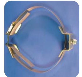
THDW-100 ELECTROLIER MOUNTING SET

Fits any size post from 3" diameter to 8-1/2" diameter 30" strap, flared leg bracket, hex bolt and washer, strap buckle with fastener bolt.