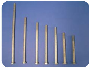
3/8" GALVANIZED BOLTS