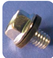
5/16" X 1/2" BOLT WITH NEOPRENE WASHER #16502815