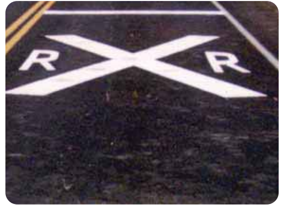
RAILROAD CROSSING #13709010