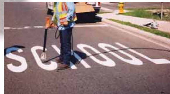
SCHOOL CROSSING #13709006

Custom Designs and Legends also available, please call for assistance.