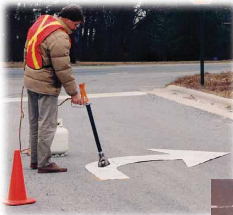
TURN ARROW RIGHT #13709040