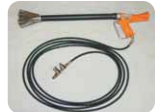
200 EX HEAT GUN #13709900