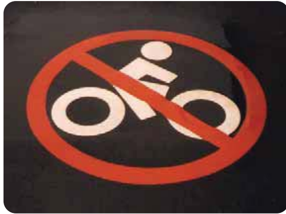
NO BIKING #13709275

Pavement & Parking Lot Flagger Equipment