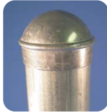
Rain Cap #12601000