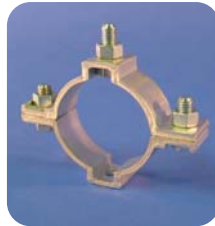
Extruded aluminum brackets, secures one or two traffic signs to 2-3/8" pipe post. Includes 2 brackets, 2 hex bolt/nut sets, 2 hex head bolt/round cap nut sets #16501520