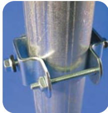
THDW-107 Double Bracket (fits 2-3/8" OD Pipe) #16501000