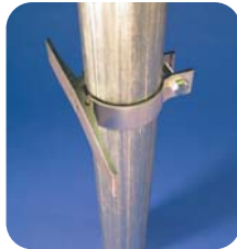
THDW-500 Extruded Aluminum Sign Mounting Brackets